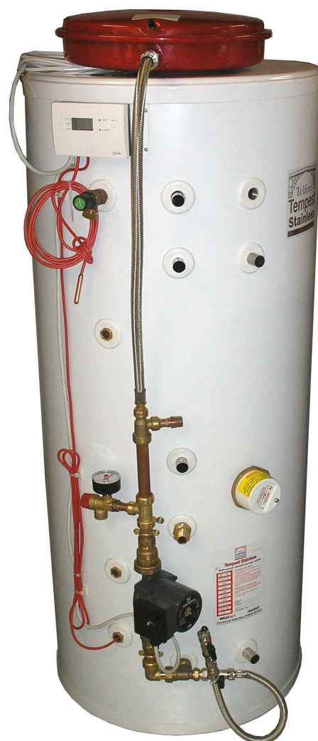
Indirect Twin-Coil Unvented Solar Ready